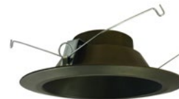
Oil Rubbed Bronze