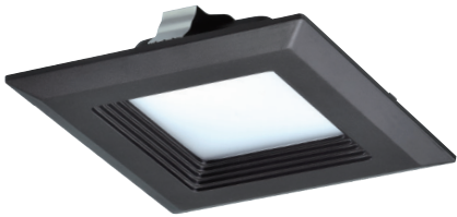
Oil Rubbed Bronze